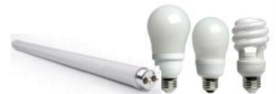
Florescent and CFL light bulbs