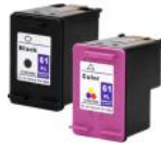
Ink jet cartridges