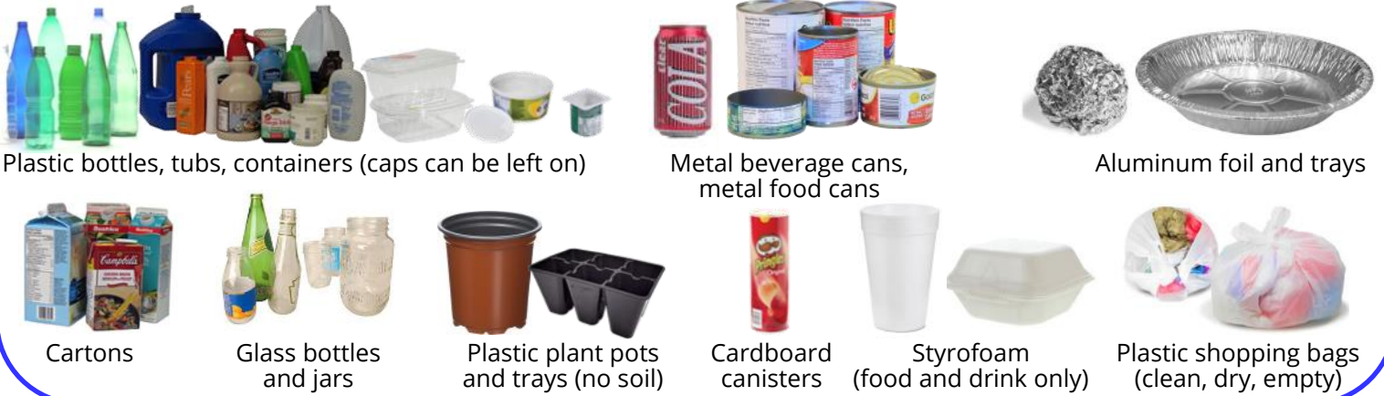
Plastic bottles, tubs, containers (caps can be left on)

Rinse all containers and ensure they are clean of liquids or food