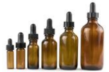
Natural health products