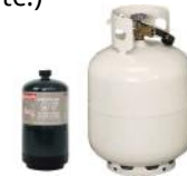
Propane tanks, Propane cylinders