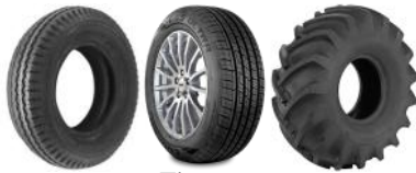
Tires (any size, on or off rim)

"Electronic Waste" is accepted at Haliburton, Harcourt, Kennisis Lake, West Bay, West Guilford Landfills during regular operating hours.