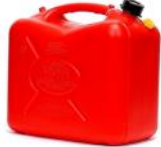
Gasoline (containers NOT returned)