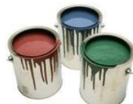
Paint (latex and oil)