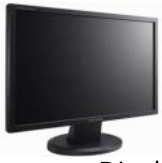
Display devices (televisions, monitors, etc.)