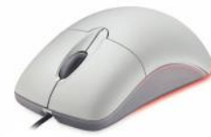
Computer peripherals (keyboards, mice, etc.)