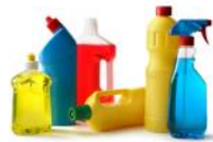
Cleaners (bleach, oven cleaner, etc.)