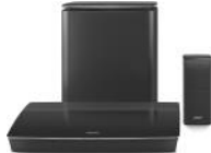
Home theatre systems