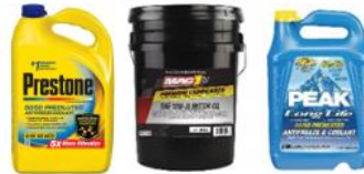
Used oil and antifreeze containers (empty only, 30 litres or less)